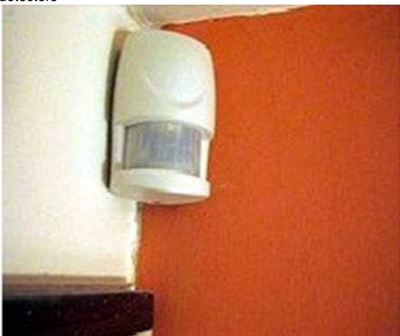
C:\Users\MCS\Desktop\1.jpg Passive Infrared Sensor

These types of sensors are designed for indoor use. Outdoor use would not be advised due to false alarm vulnerability and weather durability. Passive infrared detectors