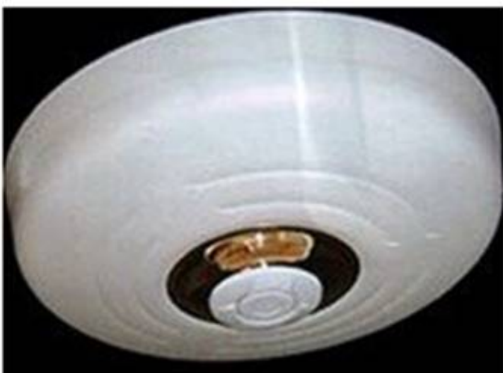
C:\Users\MCS\Desktop\1.jpg Heat Detection System

Smoke, heat, and carbon monoxide detectors