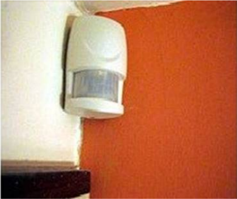
C:\Users\MCS\Desktop\1.jpg Passive Infrared Sensor

These types of sensors are designed for indoor use. Outdoor use would not be advised due to false alarm vulnerability and weather durability. Passive infrared detectors