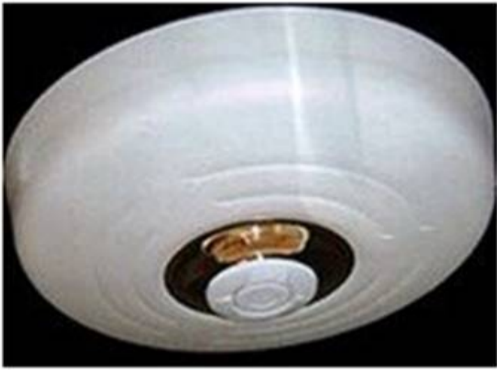
C:\Users\MCS\Desktop\1.jpg Heat Detection System

Most systems may also be equipped with smoke, heat, and/or carbon monoxide detectors. These are also known as 24 hour zones (which are on at all times). Smoke detectors and heat detectors protect from the risk of fire and carbon monoxide detectors protect from the risk of carbon monoxide. Although an intruder alarm panel may also have these detectors connected, it may not meet all the local fire code requirements of a fire alarm system.